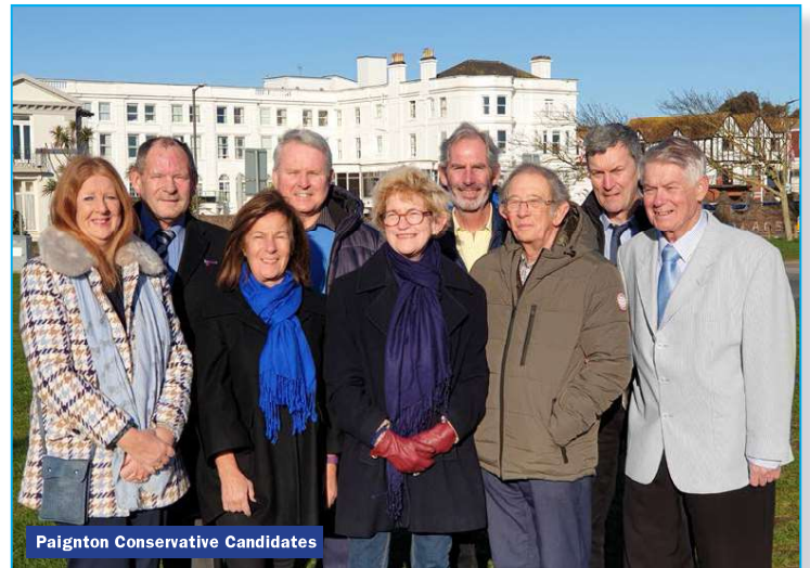
Paignton Conservative Candidates

Torbay Conservatives are committed to making these changes happen. These elections will be the most important in a long time so it is our chance to grab the opportunity and make a difference for all of us, as we all live within the Bay.